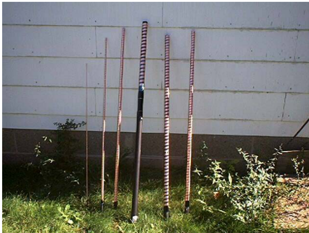
Dave KD3EM shows us a neat trick for the SD20 Pole

ALL FPqr frequencies are UP 4 kHz from the standard qrp frequencies except for 20 meters.