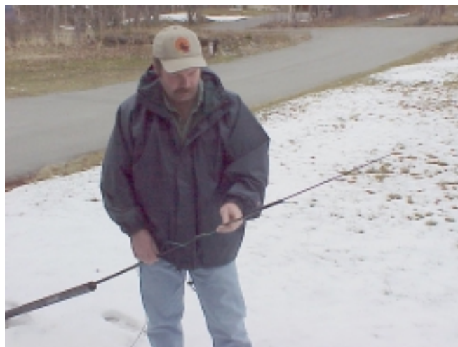
The end of the ant pokin thru. I've added a ring terminal, which lets me attach other sections of wire off the top making an "inverted L" when there is another support available.