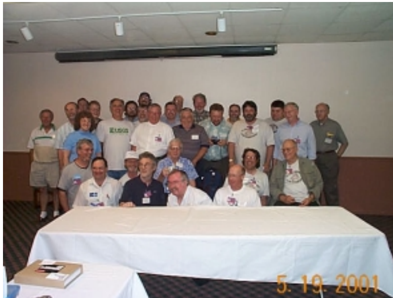
The "Gang" at FDIM 2001

ALL FPqrp frequencies are UP 4 kHz from the standard qrp frequencies except for 20 meters.