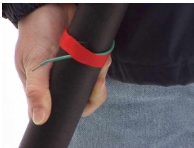
Velcro cable tie secures the bottom end. It's waiting for the BA-1 balun by LDG to attach. I add another Velcro cable tie to the RG58 feedline and mast to make things tidy. Yeah I know ... its "politically incorrect" to use a balun on a vertical. But those DX stns in my logbook could care less about my "political polarization" ;-)