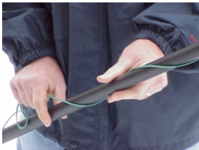
Rotating the mast to give that vertical wire spiral look ;-)