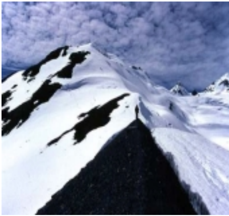
Ridgeline in Chugach Mountains east of Anchorage.