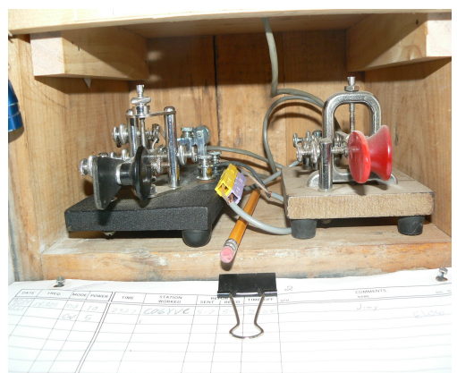
Note the yellow and violet power pole connector

As you can see there are three main sections – keys, rigs and power.