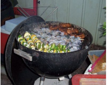
GR1LL is cooking up a few Qs.

The breakdown that was submitted to the League is as follows using Flying Pigs QRP Club - MD/DC Chapter: